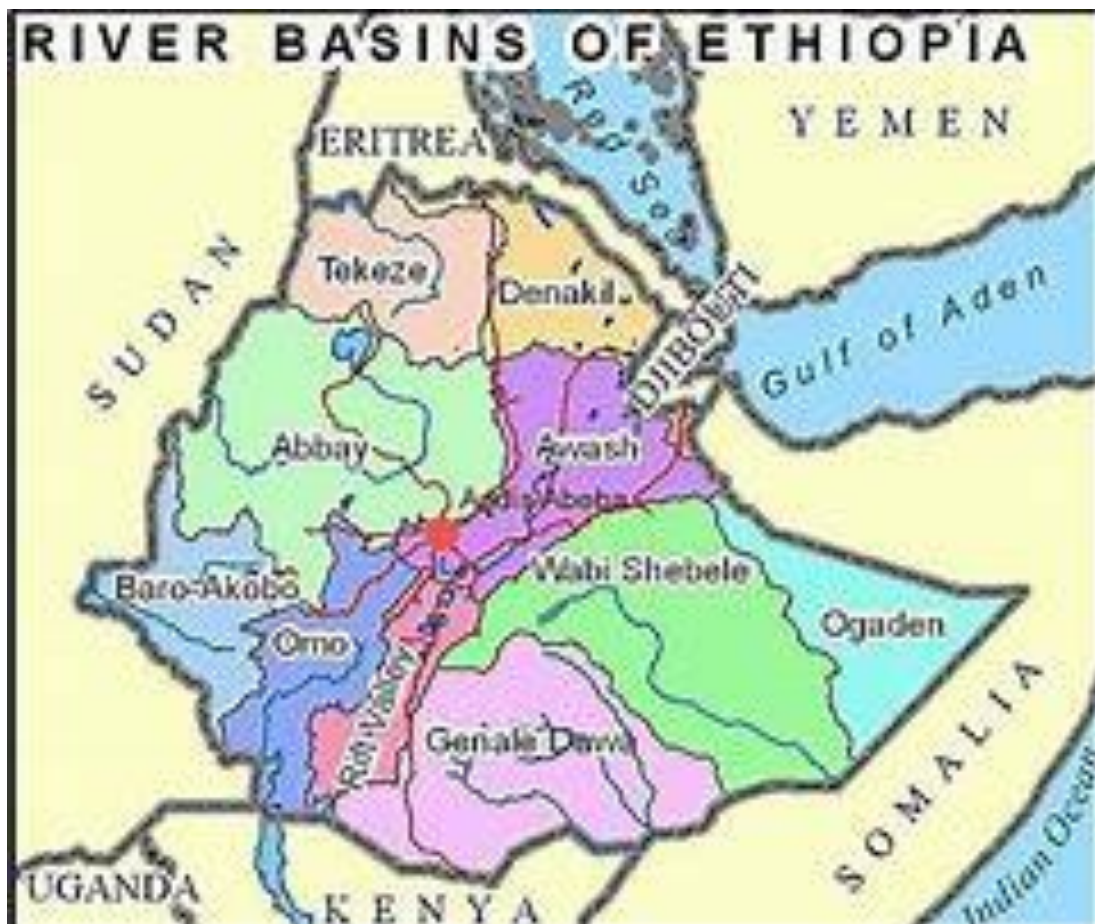
Figure 2. Proposed Basin States [Proposal, page 11]

Accordingly, the new state administrative structure proposed by the two Engineers will constitute of the following administrative states: 1. Abay basin state; 2. Awash, Ayisha and Denakil basins states; 3. Baro-Akobo basin state; 4. Genele-Dawa basin state; 5. Tekeze and Merib basins states; 6. Wabi-shebele and the Ogaden basins states; 7. Omo-Ghibe basin state; and 8. Rift valley Lakes basin state. [Proposal, page 11] Moreover, I suggest that the two Engineers change all references in their Proposal to a “Basin State” or “Basin States” to “Administrative Region or Regions”. It is important also that we avoid any reference of a separate sovereign entity within the State of Ethiopia.